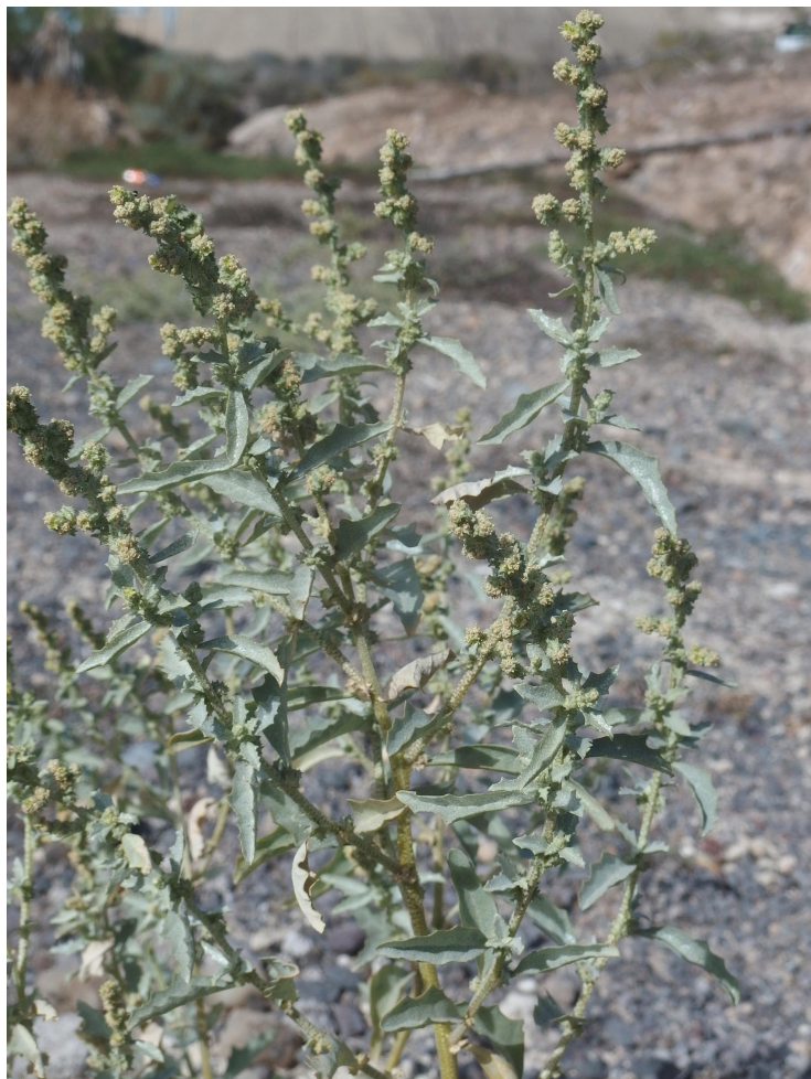
Figure 2. Inflorescence of Atriplex semilunaris Aellen in Arico, Tenerife, 19 January 2019, F. Verloove.

with many trucks driving back and forth, it is tempting to think that the plant may have been brought in with waste and the associated transport. Since 2019 the locality has been monitored by the Canarian Early Warning Network for Invasive Species (RedEXOS 2024).