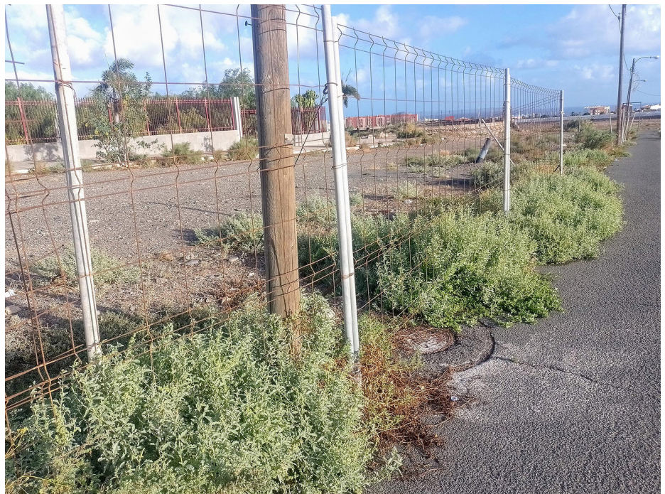
Figure 5. Typical heavily disturbed habitat of Atriplex semilunaris Aellen in eastern Gran Canaria (Santa Lucía de Tirajana), 21 December 2023, F. Verloove.

A few years later, the species was recorded in abundance by the first author (FV) in December 2023 in adjacent areas slightly further south. It was first observed in Pozo Izquierdo, in the municipality of Santa Lucía de Tirajana, where it is ubiquitous, with thousands of individuals, in ruderalized coastal habitats (roadsides, vacant lots in residential areas, dry waste grounds, etc.). It extends further south to the estuary of the Barranco de