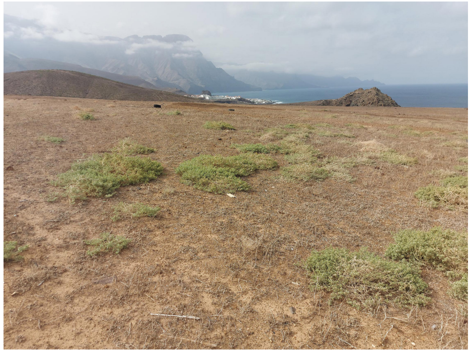
Figure 4. Habitat of Atriplex semilunaris Aellen in northwestern Gran Canaria (Gáldar), 17 March 2024, A. Reyes-Betancort.