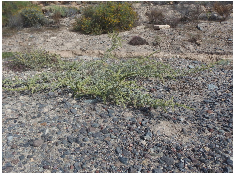
Figure 3. Habit and habitat of Atriplex semilunaris Aellen in Arico, Tenerife, 19 January 2019, F. Verloove.