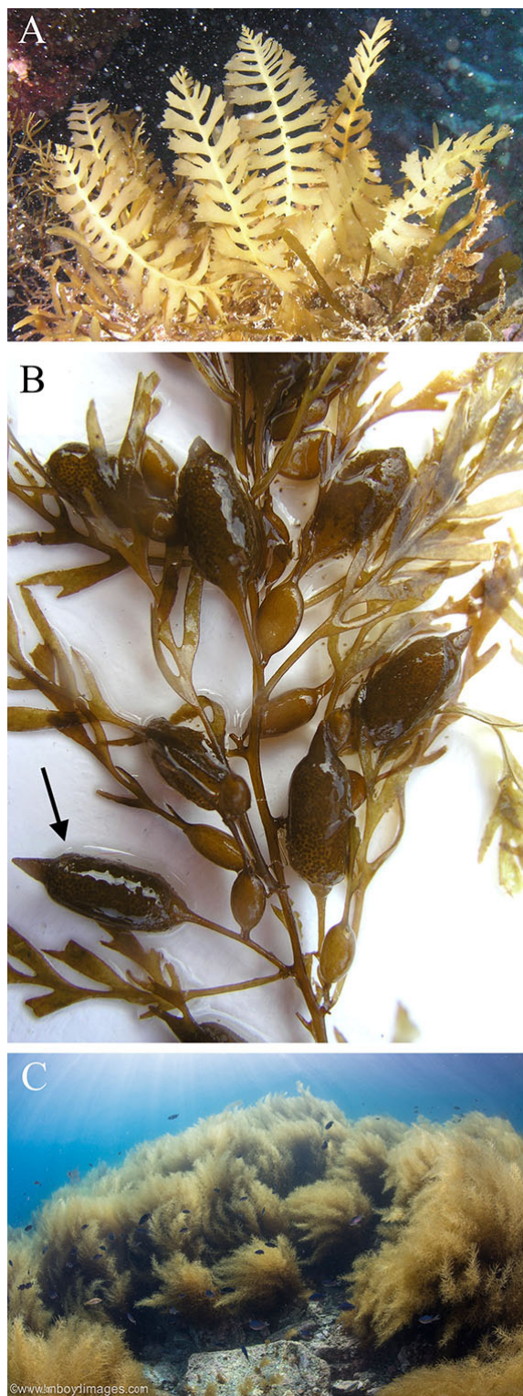
Figure 1. Sargassum horneri morphology and life cycle. (A) Recruit, (B) Mature thallus with reproductive receptacles indicated by arrow, (C) Thick canopy on a shallow reef.

coast of North America, where it has spread rapidly since it was first detected in Long Beach Harbor, California, USA, in 2003 (Miller et al. 2007). We also discuss potential factors influencing the spread of this species and the implications of its invasion to native ecosystems.